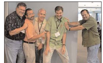
Leaders from Hill Country Bible Church.

Their church plants form the Hill Country Association, and they are very intentional about instilling this vision in every Hill Country plant. To accomplish this HCBC builds their training around what they call the "Seven Characteristics of a Model (or healthy) Church." They provide self-study materials for their planters to learn the nuts and bolts of church planting (such as the Church Planter's Toolkit by Bob Logan. 3 ) But their passion is instilling these characteristics in the genetics of the new church. And to ensure this, they have created diagnostic questions for accountability. (See sidebar.)