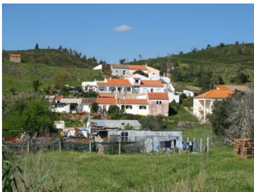
Recently built villas in Portugal –Ukrainians are involved in the Portuguese construction industry

Several hundred miles further south, migrant workers from the Ukraine have planted seventeen Ukrainian Baptist churches since 2005 in Portugal, a country that has around fifty indigenous Baptist churches. With the support of the Portuguese Baptist Union, they have a seminary to train church planters, and have even sent a missionary back to Ukraine, financially supported by the Ukrainian migrant workers.