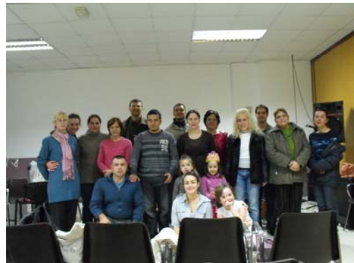
A Bulgarian group gathers for training in Madrid, using BBL materials

“We plan to deliver interactive training through internet lessons to help people to be trained; not only through seminars where they have to travel from many places to gather in one place, and usually people are so busy that they have no time to travel. They can watch these lessons through the internet and then we can contact them and build our relationship with them.”