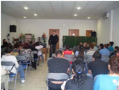
The newly planted Bulgarian church in Hatvia, Spain

Members of the Bulgarian Bible League have also met with key Bulgarian church leaders in Madrid, where the biggest concentration of Bulgarians and as a result, they have started church-planting training in Madrid.