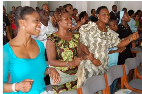
Worshipping in Denmark

And in Copenhagen, Denmark, over 50% of church goers on any given Sunday will be “new Danes” – people whose country of origin is not Denmark.