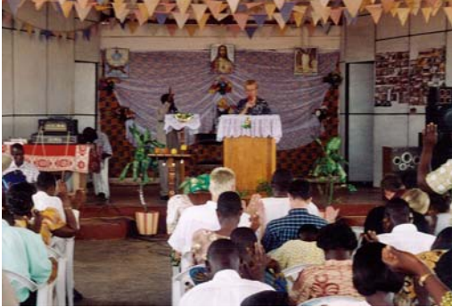
Visiting a Vineyard M.A.V.E church in Africa

M.A.V.E, who in turn visit and mentor the leaders of the M.A.V.E churches.