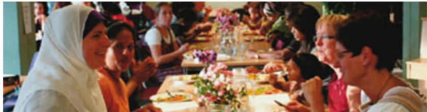
Sharing a meal together

together, while the Vietnamese and Danish churches have their services. The Sunday school is 100% Danish, but the children are from all the different cultures. Then they eat together and the Burmese church has their services in the afternoon.”