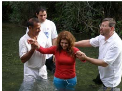
Baptism in Valencia region

“In Spain, some of the Bulgarian migrants are from a gypsy background. Even in Bulgaria it is hard for them to be integrated into society. When they move to Spain they remain a separate group. With people like this, are there more opportunities for the Gospel for people reaching others from their own community in a different country?”