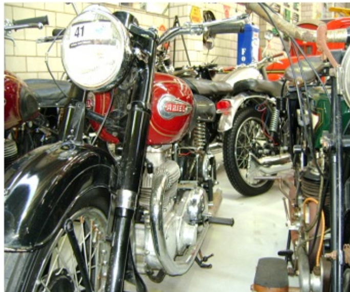
This 1950 Ariel Square 4 Motorcycle was my bike of choice at the Classic Auction. It sold for $16,000 – not a bad price for an “old” (sorry - vintage) bike!

Anyone familiar with Driscoll’s speaking and writing is aware that much of what he communicates is black and white; most of his positions are rigid, and it comes across as “like it or lump it.” This might work well in a local church setting and Driscoll intimates in the chapter on church unity that this is critical for