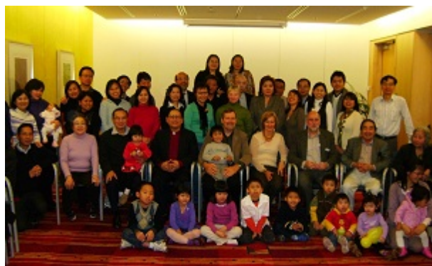
The Indonesian Reformed Church at their 7 th anniversary celebration in June 2009.